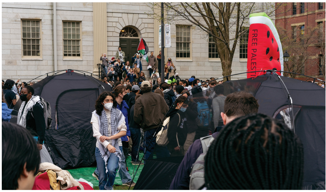
Hundreds of students set up an encampment in Harvard Yard on April 24, 2024