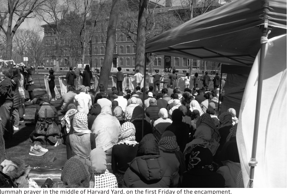
ummah prayer in the middle of Harvard Yard, on the first Friday of the encampment.

AT THE BEGINNING OF THE 20-DAY GAZA SOLIDARITY ENCAMPMENT IN HARVARD YARD. THE FOLLOWING IS AN UPDATED VERSION OF THE GROUP'S DEMANDS.