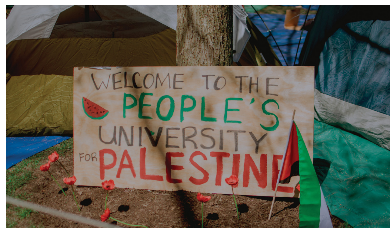
A sign in the Gaza Solidarity Encampment.

just two examples of Harvard's investments in — and profiting from — not just the rigid surveillance of Palestinian lives but the routinization of mass Palestinian death in this ongoing genocide.