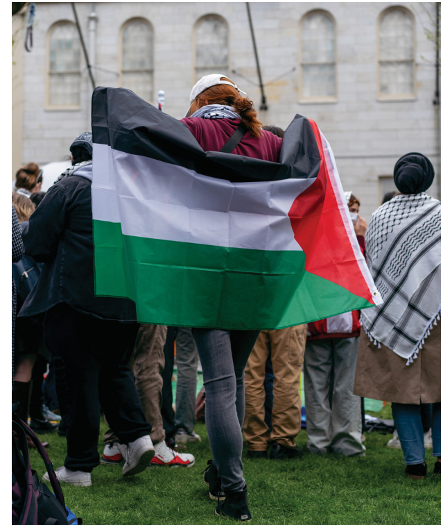
A protestor walks through the encampment draped in a Palestinian

The only semblances of comfort I found on campus were in organizations like the Harvard Undergraduate Palestine Solidarity Committee, which saw me as more than my identity while also celebrating it. I organized with the PSC for months, attended their cultural events and ate manakeesh just as my mom makes it, and met comrades who became some of my closest friends. And then, the PSC was suspended by Harvard's draconian administration last month. Just like that, the only official af-