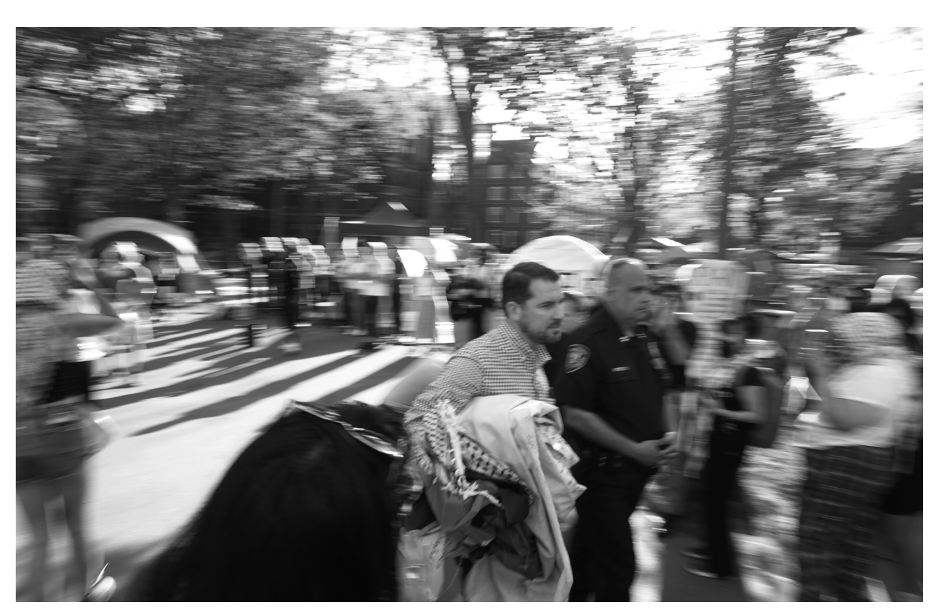
Escorted by Harvard's police force, an administrator strips down and confiscates a banner bearing just some of the names of the 40,000 martyrs of Israel's genocide.